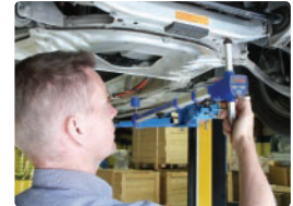
On the lift For fast & accurate damage analyse