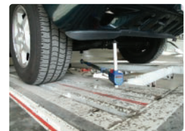
On the rack