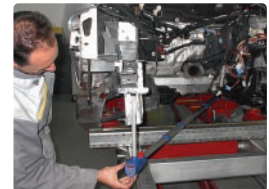
On the bench